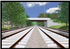
West Approach - View of Bridge