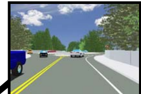
Alexander Road - East Approach