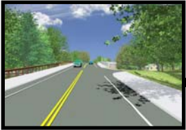
North Post Road - West Approach