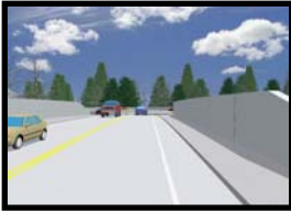
Alexander Road - North Approach