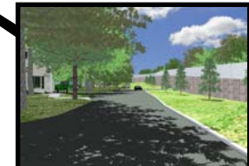
Frontage Road - View From East