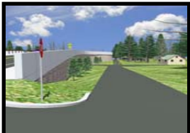
Frontage Road - View From West