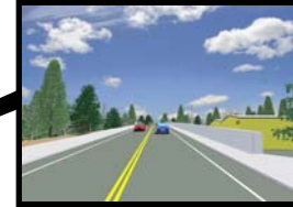
Alexander Road - Traveling toward Roundabout