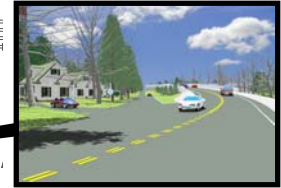
Alexander Road - East Approach