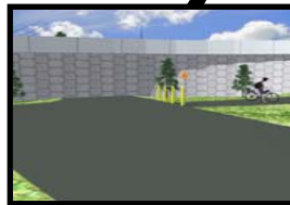
Frontage Road - View of Retaining Wall