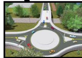
Aerial View of Roundabout