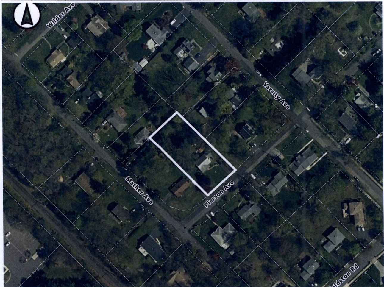
Map 1: Aerial of Subject Site (scale: 1" = 150')