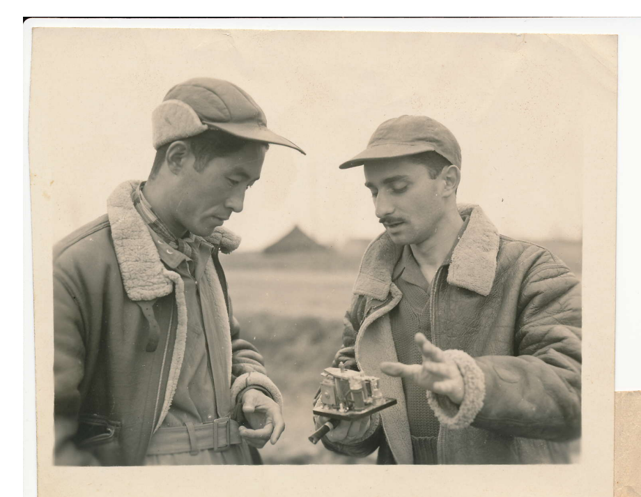
Photo and news article by the US Public Relations Office, printed in the Times-Review, Teaneck, NJ, 1943.

FROM: FOURTEENTH AIR FORCE PUBLIC RELATIONS OFFICE